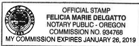
Notary Public-State of Oregon