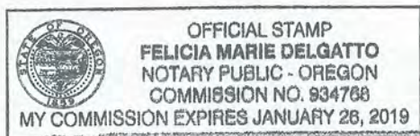
Notary Public-State of Oregon