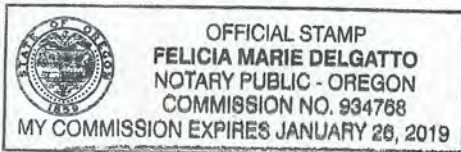
Notary Public-State of Oregon